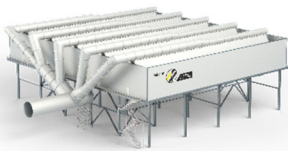
AIR COOLED CONDENSERS ACC