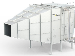
AIR DRYER HEAT EXCHANGERS