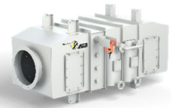
ECONOMIZERS HEAT RECOVERY