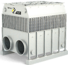
GAS-GAS HEAT EXCHANGERS REKULUVO/REKUGAVO