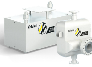
PRINTED CIRCUIT HEAT EXCHANGERS K'BOND