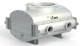
FULLY WELDED HEAT EXCHANGERS K'FLEX