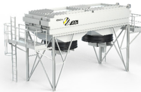
AIR COOLED HEAT EXCHANGERS AFC