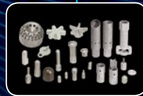
PARTS & SERVICE