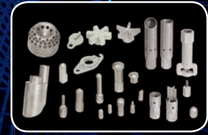
PARTS & SERVICE