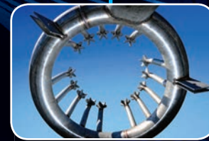
Upper Steam Ring