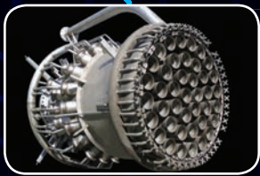
Replacement Flare Tips