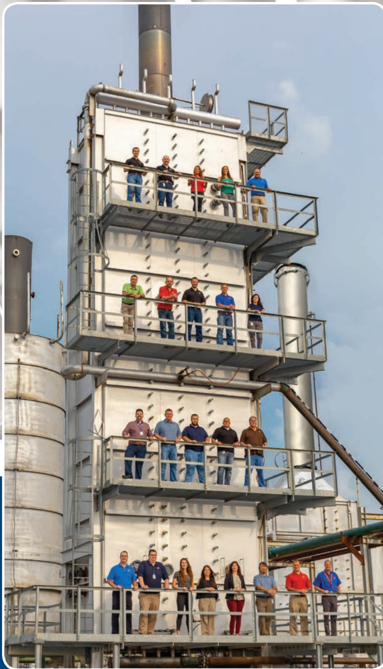
Zeeco's aftermarket products and services team

Zeeco is the world leader in aftermarket combustion products. We offer replacement components for our own superlative equipment, as well as competitors' parts, all at extremely economical prices. While our normal response and ship times are some of the fastest in the industry, expedited deliveries are our specialty.