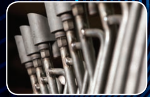
Flare Parts & Ignition Systems