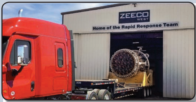
Rapid Response Team

At Zeeco, we keep the flare-ups confined to your products – not your service. Our customers consistently tell us, across the board, we are friendly, responsive, and easy to work with.