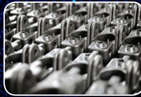
Oil Gun Parts